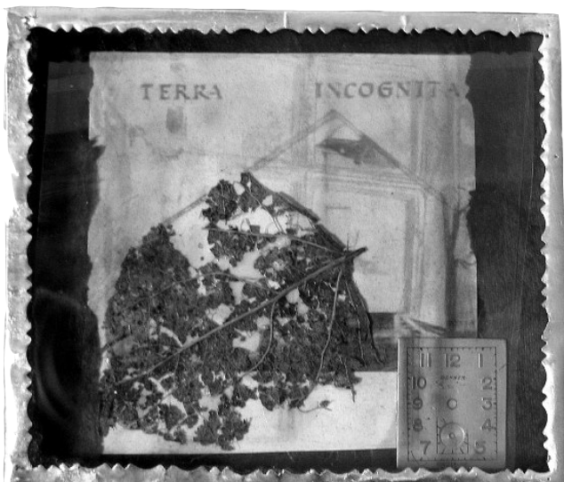
This finished reliquary houses a delicate fragment of a decomposed leaf. I trimmed the copper tape with fancy scissors to create the scalloped edge.