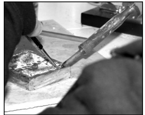
Solder jumprings onto the back if you want to hang the reliquary to display it.

11. On the back of the reliquary, solder two large jumprings, one on each side about 1” down from the top, lined up vertically. Place them in a way that they don’t stick out—that is, they can’t be seen from the front.