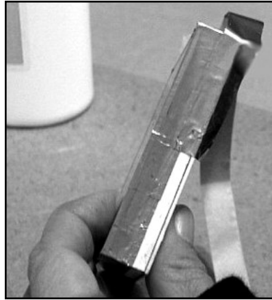
In this photo, the first piece of copper tape has already been applied to secure the glass to the box. Now I’m adding the second piece of tape along the bottom edge. You also can see how the box sides sit on top of the back piece.

loosely wrapping it (with the backing still on) around the sides you will cover. Tape the front first by laying down the tape so that there is an even width of it overlapping all four sides of the front glass piece (overlap at least 1/8” on the glass). I start each wrap in the middle