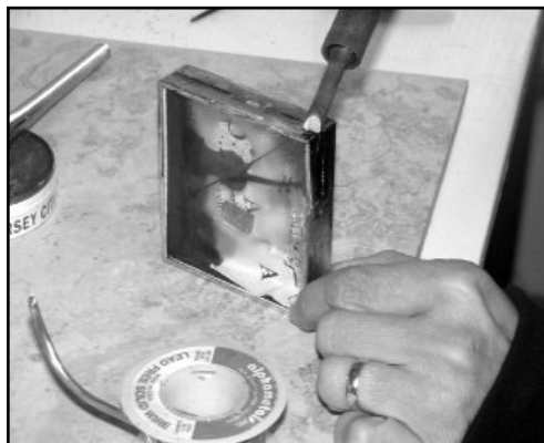
Cover the copper tape with a generous layer of solder.

10. Use an old paintbrush to cover taped areas with flux, then apply solder to cover all the tape. Holding